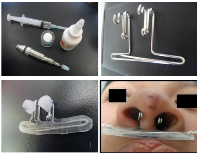
A, B, D, C. Figures 2 A, B, C and D Place retainer for nasal tip projection made for this treatment by the Hospital orthodontic services for the Hospital para el Nino Poblano, wired the 0.36 with loops for activation, together with acrylic and supported by elastic as retention