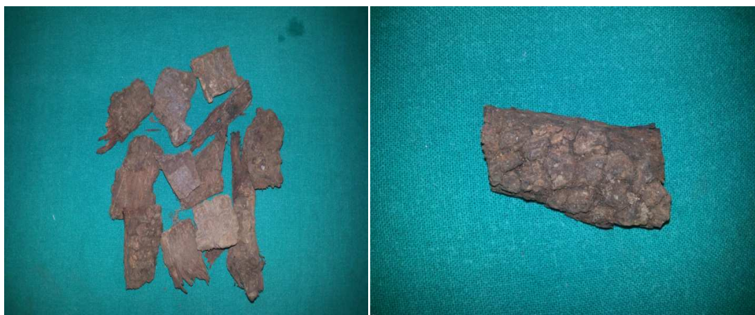
Fig.1: Stem bark

One of these herbs, a common Indian native plant is Mimusops elengi Linn. It is a handsome evergreen tree of family Sapotaceae; Linn stands for “Carl Linnaeus” who first described the modern taxonomy of plants. It is also called as Bulletwood tree or Spanish cherry in English; Bakul in Hindi; Maulsari or Chirapushpa in Sanskrit; Elengi in Malayalam; Ranja in Kanada. 3 It reaches upto a height of 15-16 meter, found in all over the Indian subcontinent. 4 The new leaves come generally in the month of February and shape is oval, elliptical, with undulated margin. The leaves are 6-10 cm. long and 3-5 cm. wide with vibrant shiny green coloured surface. The older leaves become dark green in colour. The tree has grayish black channeled bark, which has 10-20 cm longitudinal fissures. The tree is sacred in India since ancient time, due to its fragrant flowers, which are widely used in gardens, temples, ornaments of Hindu Gods, garlands etc. These white flowers have been described as symbol of love and beauty in famous Sanskrit literature of Kalidasa. 5 The berry is yellow-orange in colour, fruiting in august and is having astringent property. Seeds are grayish-brown in colour.